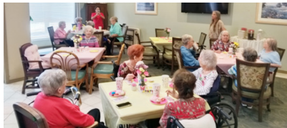
Mothers day party