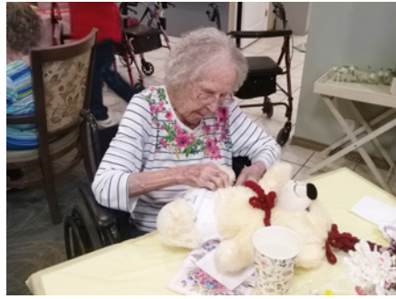
Modena putting on a diaper